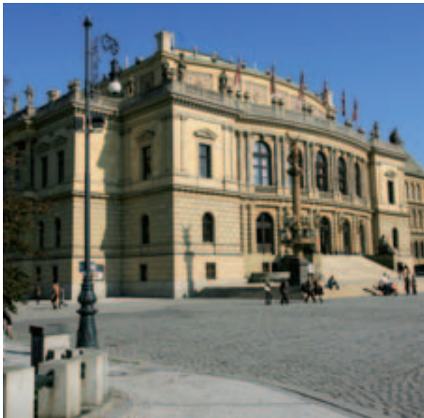
Rudolfinum, náměstí Jana Palacha, Prague 1