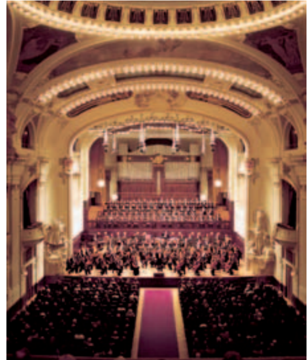
Municipal House, náměstí Republiky 5, Prague 1