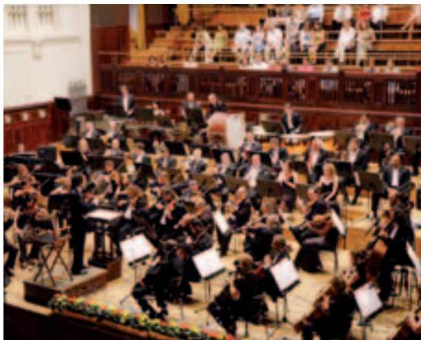
Municipal House and other venues in Prague.

International Music Festival offering classical music and jazz concerts.